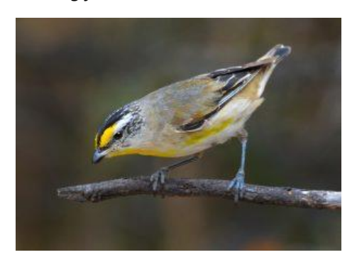
This is a pardalote!