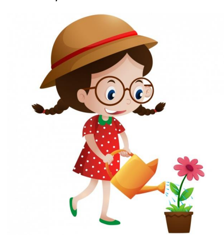
Can you help water your plants...