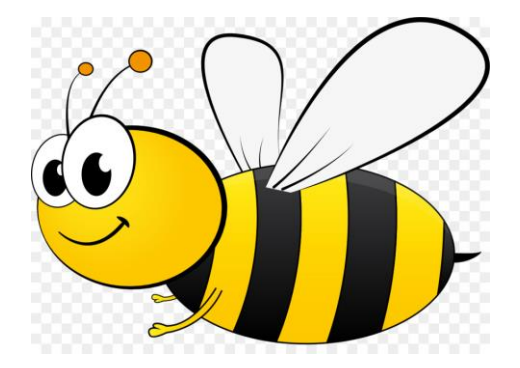
Looking for the nearest bee hotel!

Updates on what the KRA are up to and issues affecting your village.