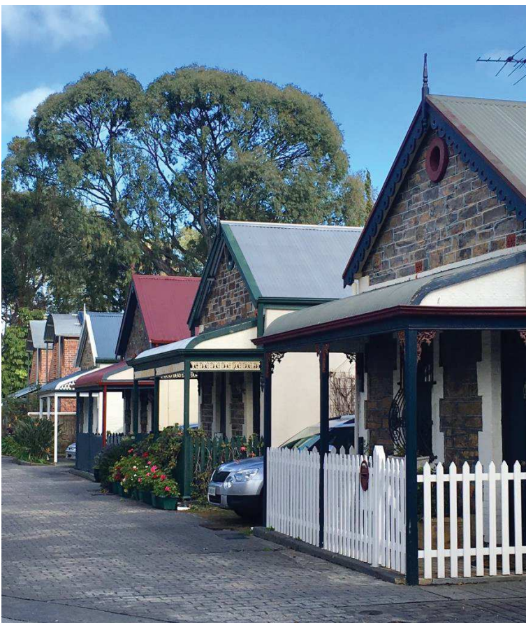
Streetscapes such as Richmond Street above are under serious threat.

To play your part, let our Parliamentarians know your views and urge them to delay the code until it is fit for purpose! It is important to download and sign the hard-copy petition to parliament (go to https://protectourheritage.nationbuilder.com/petition1 ). Also, write to our local MP, Vicki Chapman ( bragg@parliament.sa.gov.au ), the Planning Minister ( ministerknoll@sa.gov.au ) and the Premier ( dunstan@parliament.sa.gov.au ). For more info on the draft code and to make a formal submission, go to www.saplanningportal.sa.gov.au .