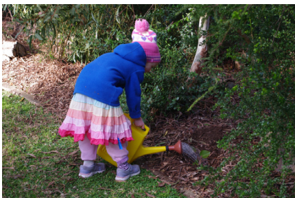
Pioneer Park - Photos by KRA

Thanks to everyone who helped out and to our amazing catering team who managed to feed so many hungry mouths at morning tea and lunch!