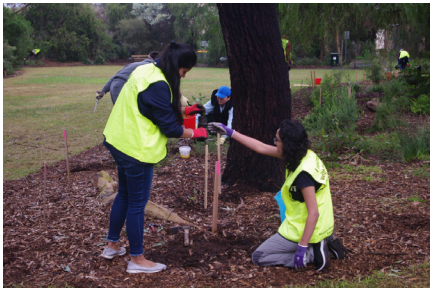
Borthwick Park - Photo by KRA

Borthwick Park major planting day, 5th July, 2020