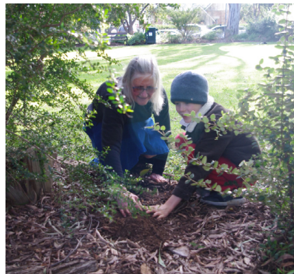
Pioneer Park - Photos by KRA

Please indicate below if will be available to help out occasionally over the next year. We will ensure your name is on the list and would love to see you at one of our sessions.