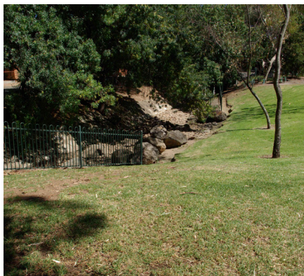
Borthwick Park - 2011