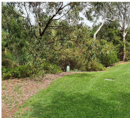
Borthwick Park - 2020