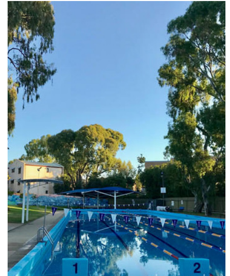
Kensington & Norwood Pool

Don't forget to make a splash at our local pool, which is now open for the summer season! Set amongst the gum trees, our heritage-listed pool is located at the southern end of Phillips Street past the Mary MacKillop school.