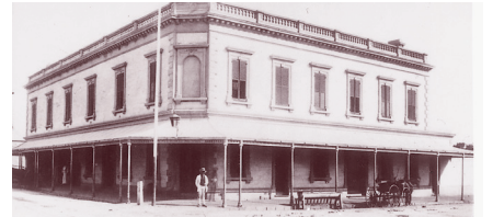
The Rising Sun Hotel