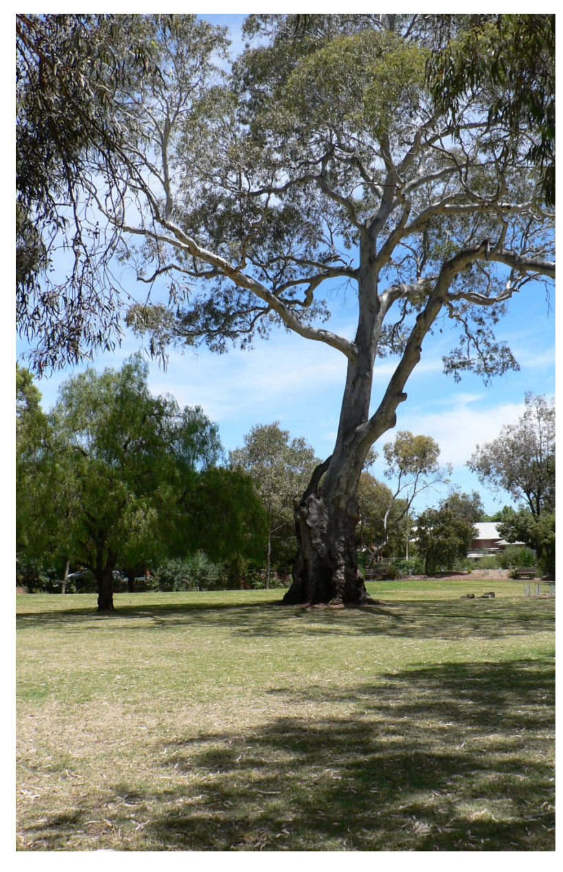
Central Redgum in 2014 and today