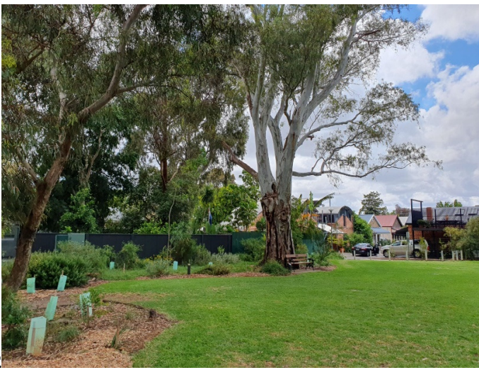
Richmond Street entrance 2022