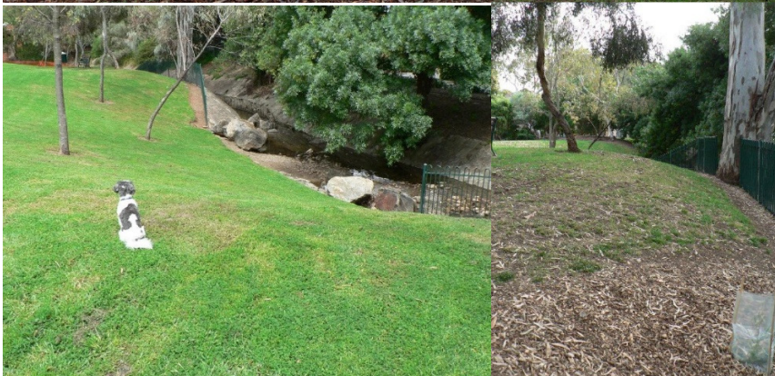
Bank of Second Creek, 2010.