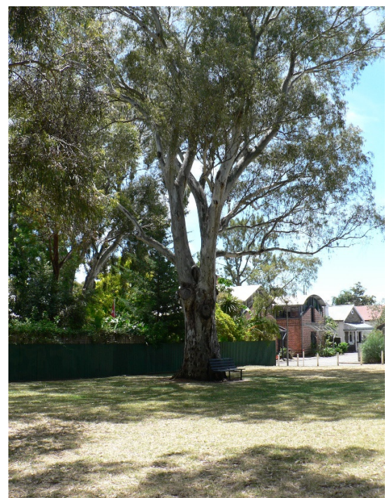
Richmond Street entrance 2014