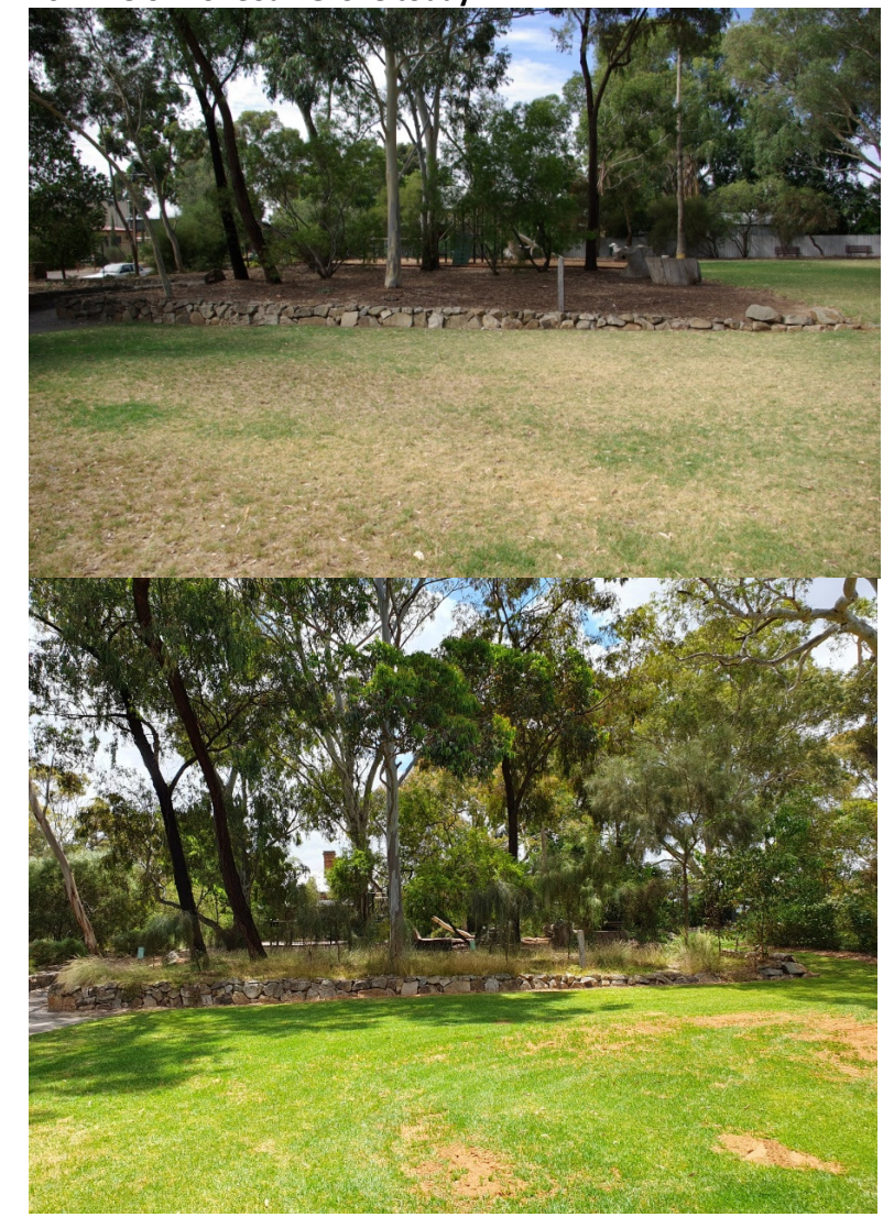
2014 Top, site of existing Sheoak Grove 2022 Below. Sheoak Grove today