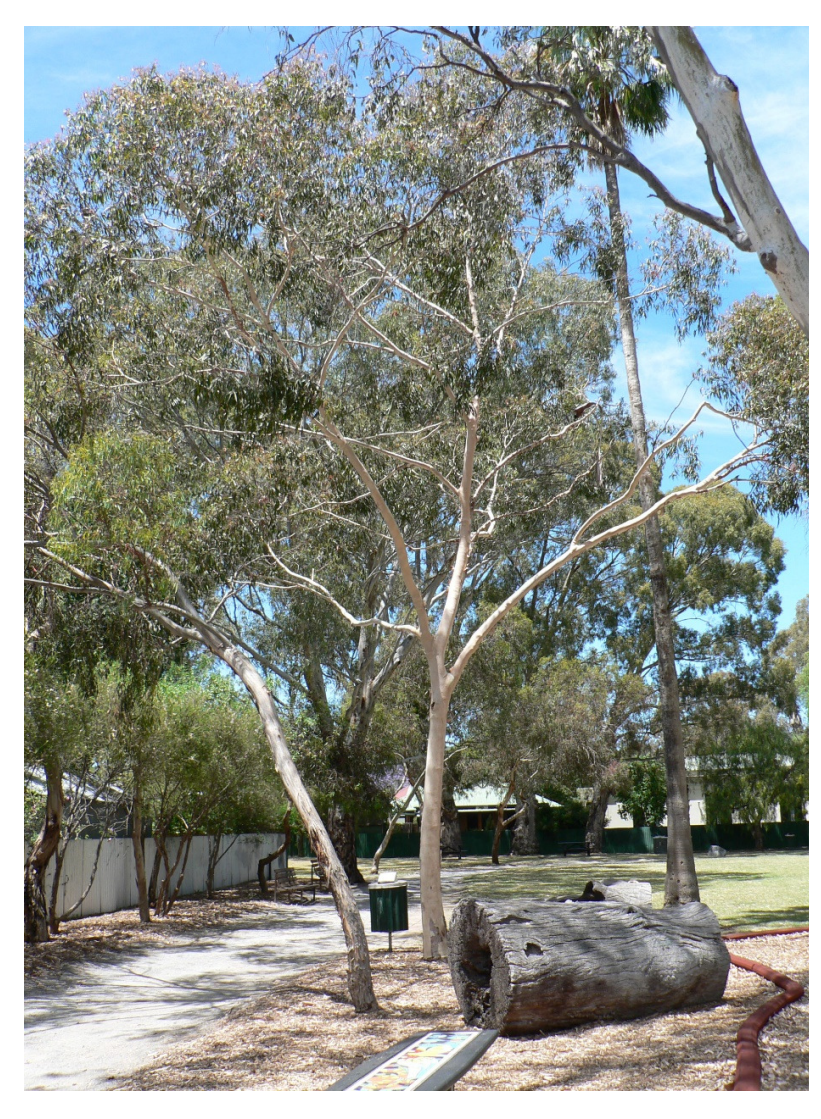
Entrance from Thornton St 2022