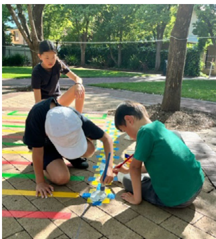
2023 grant winners working on their Jump For Joy project