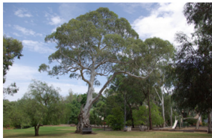
Central River Redgum 2009 before (above) and after (below)