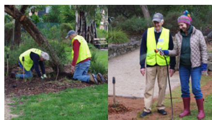
Photos from June Planting Working Bee

If you'd like to find out more about the widely acclaimed biodiversity project which has transformed Borthwick Park since conception in 2009, find the 2022 project update on the KRA website https://www.kra.org.au/wp-content/uploads/2023/08/BP-Project-Update-Dec-2022.pdf