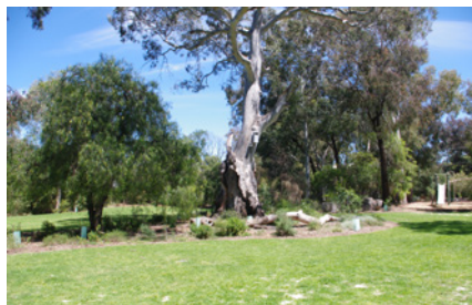
Below photos from July's Working Bee